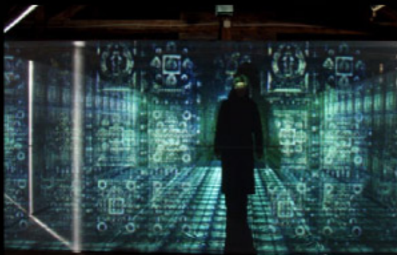
RESPONSIVE ENVIRONMENT, JAPAN