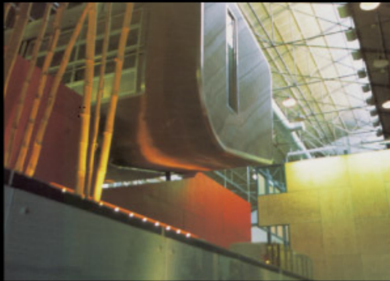
JAIME ROUILLON, JRA, COSTA RICA

International Guests will run three Design Studios to develop proposals for Cockatoo Island: